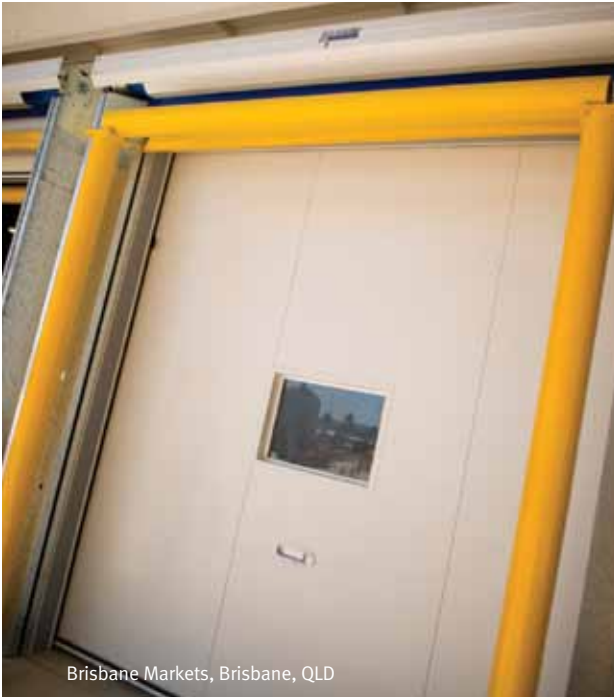
Brisbane Markets, Brisbane, QLD