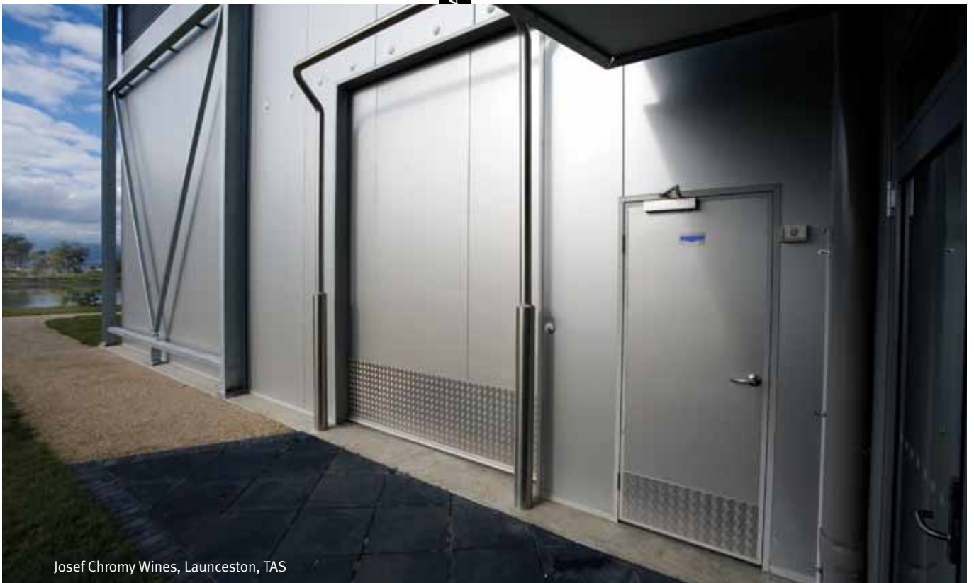
Josef Chromy Wines, Launceston, TAS

ANELS > PIR PANELS > MINERAL FIBRE PANELS > BONDOR > EPS PANELS > PIR PANELS > MINERAL FIBRE PANELS >