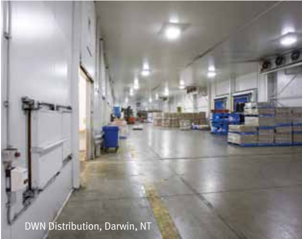
DWN Distribution, Darwin, NT